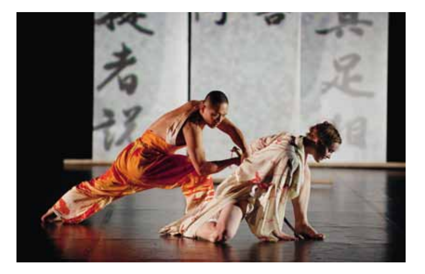
TeZukA, 2011.