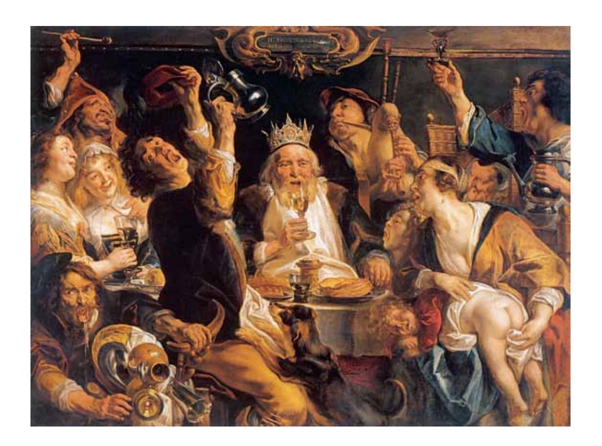
Jacob Jordaens, The King drinks, ca. 1640. Oil on canvas, 156 x 210 cm. Royal Museum for Fine Arts, Brussels.