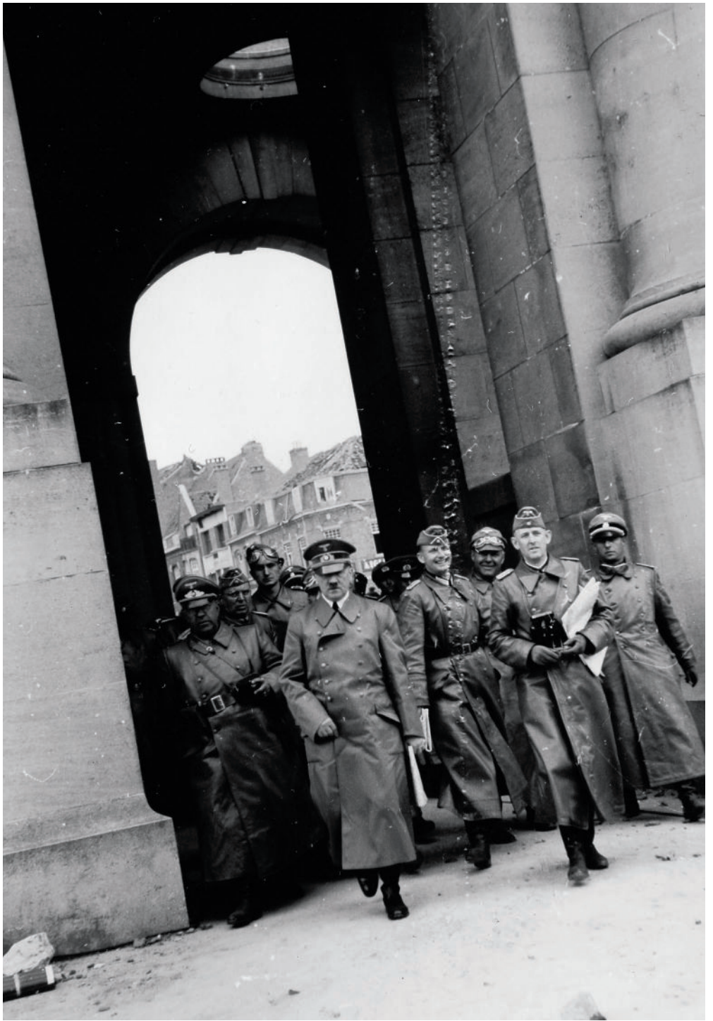
Adolf Hitler in Ypres, 1 June 1940, with the Battle of Dunkirk still raging