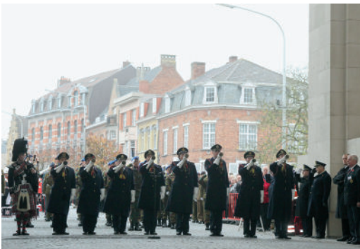
Last Post Ceremony in grand style

Those present repeat the last sentence. The Exhortation is followed by a minute's silence – which many feel to be the most moving part of the ceremony – and the laying of wreaths. The ceremony ends with the sounding of the Reveille. The Last Post Ceremony rarely lasts more than five to ten minutes. If a piper is present, a lament is played as the wreaths are laid. If foreign dignitaries are visiting, their national anthem may be played at the end of the ceremony, but the structure of the ceremony has remained unchanged for decades. This does not mean that the Ypres Last Post Ceremony has not evolved. In the past, a day-to-day ceremony was often limited to stopping the traffic and the sounding of the Last Post by two buglers. The fire-brigade uniforms were worn only at weekends or on special occasions. During the week, the buglers wore 'civvies',