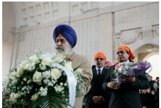
Sikhs during Armistice Day Ceremony, 11 November 2009