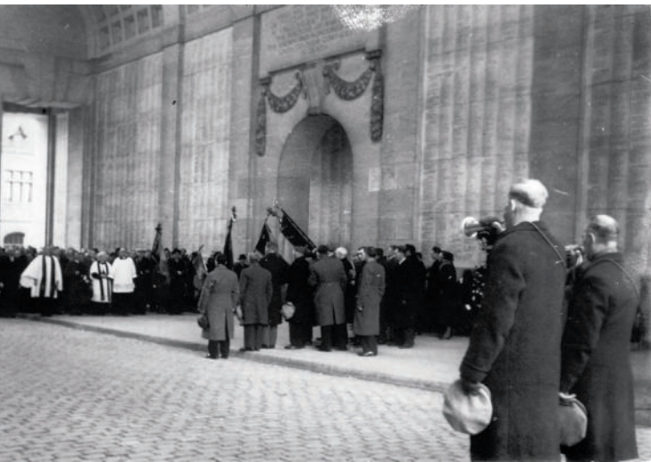
Last Post Ceremony on Armistice Day, 11 November 1936

It seems to me that the impression that the Menin Gate made on Zweig is the prevailing impression among visitors today. This partly explains why the Menin Gate, despite all its imperial pomp, has only very rarely been the target of political manifestations. However, whereas in Zweig's day the 'heaps of wreaths' were still laid by 'widows, children and friends', this is now done by a much wider range of people: relatives, school groups, associations, and so forth. The fact that the Menin Gate is still used for funerary commemoration is one reason we can refer to it as a living memorial. Another reason is that names are still added when it is found that someone should be commemorated there and that, in theory at least, names are removed when it turns out that someone is commemorated elsewhere, either with a known grave or on another Memorial to the Missing.