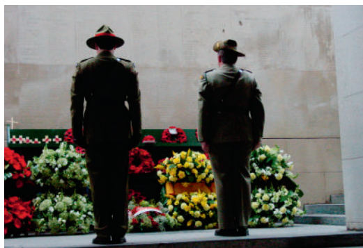
ANZAC Day, 25 April 2003

But there is more. The strength of the Last Post Ceremony has always been that it is a 'blank slate', as it were, by this I mean that everyone can attribute his or her own meaning to it. Aside from being a homage to the fallen, it can be an inspiration for military personnel to persevere in their duties, while for pacifists it is a plea for peace. For some, the Last Post Ceremony is a reminder of the purpose of the war, while for others it is a reminder of its futility. In the past, the organisers of the Last Post have had to steer a careful course to preserve its intended neutrality. In a brochure published in the second half of the 1970s, the Last Post Committee wrote that the former enemy would be honoured too, and the hope was expressed that 'by remembering the suffering that war has caused, the desire for peace will be strengthened in men of goodwill everywhere, so that the nations of the world may live side by side in mutual understanding and harmony'. On 17 May 1985, while visiting the Menin Gate, Pope John Paul II prayed for world peace. The occasion is commemorated on a paving tile on the north staircase. However, since that time it has been