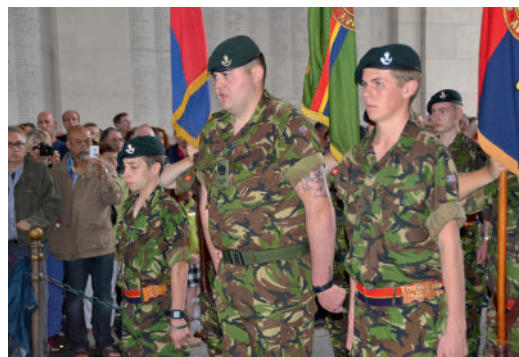
Army Cadets during Last Post Ceremony, 3 August 2012