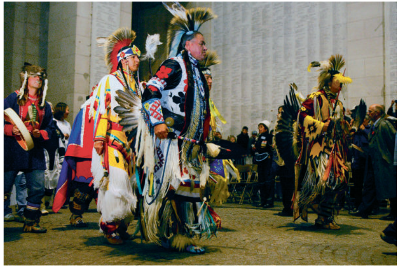
Calling Home Ceremony of Canadian First Nations during Last Post Ceremony, 1 November 2005

noticed that the Last Post Ceremony has undergone a degree of 'militarisation'; I am referring primarily to the increased active participation of armed military detachments in the Last Post Ceremony. Some members of the public object when military personnel with rifle and bayonet are given a place of honour at a Last Post Ceremony, just as others would disapprove if the ceremony were used as a platform for political statements. Given the current level of interest, among military personnel from all over the British Commonwealth and others, it is certainly not always easy for the Last Post Association to maintain the neutrality of the ceremony in this respect. In order to preserve its uniqueness and universal significance in perpetuity, it is essential that the character of the ceremony as a 'blank slate' is strictly observed, and that all participants – including military personnel – are required to observe rules in order to safeguard the perception of strict neutrality.