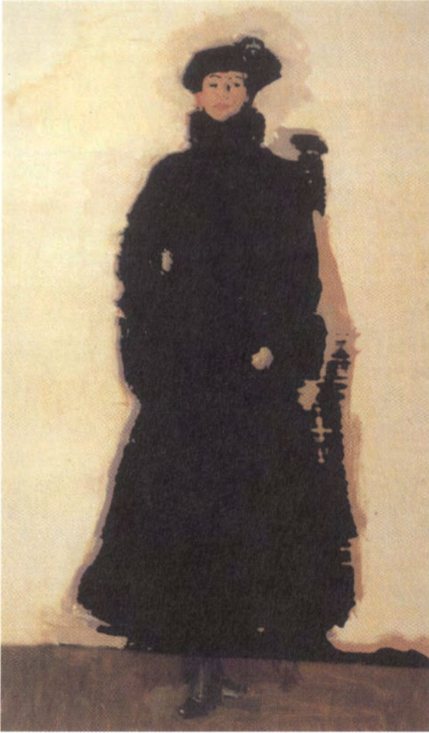
A portrait of Margaretha Zelle by Isaac Israëls. Kröller-Müller Museum, Otterlo.