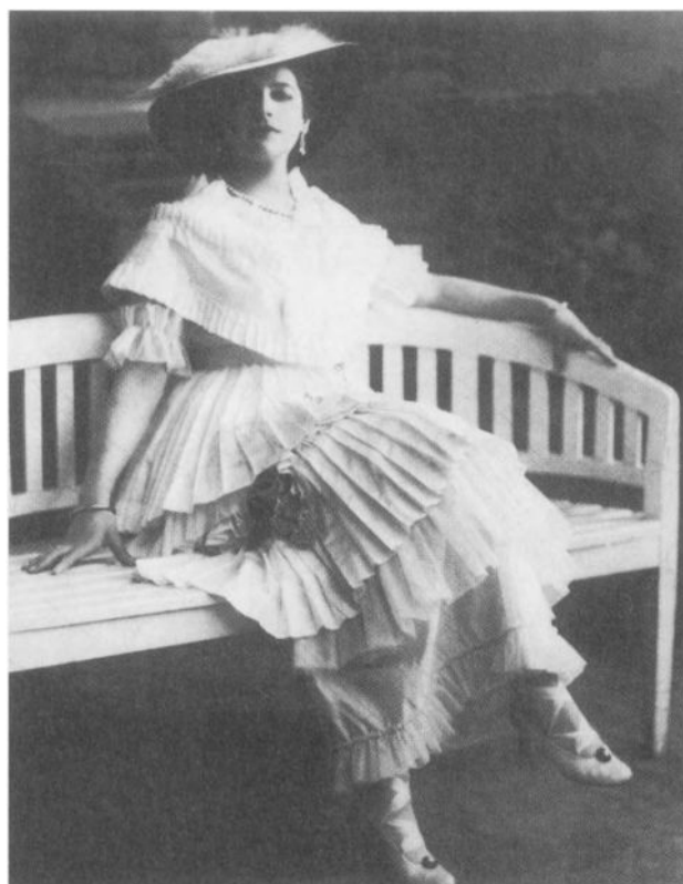
Margaretha Zelle, right after her very last performance in the Netherlands, March 1915. Mata Hari Collection, Fries Museum, Leeuwarden.

When in 1912 Mata Hari lamentably failed an audition for Diaghilev's Ballets Russes, she did her best to boost her sense of self-respect and professional integrity by taking ballet lessons, but she never really developed into more than a moderately gifted dancer. When eventually she found herself seriously challenged by other, often more talented, 'Eastern' dancers such as Maud Allen and Ruth St. Denis, and besides began to feel the competitive threat of dozens of less artistically-concerned nude dancers on the Paris circuit, her riposte, published in an interview with the British magazine The Era , was that the performances of ladies of this ilk were anything but accurate or aesthetically justifiable. In the same breath she also asserted her 'birthright': by dint of having herself been born and bred in Java and having absorbed the deeper significance of this kind of dance in her earliest youth, she was in a position to know that none but the chosen few who were born and raised there, in the heart of the tropics, were able to perform these dances properly.