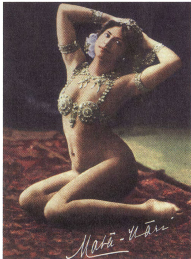
Mata Hari as an icon of the Orient, Paris, 1905.