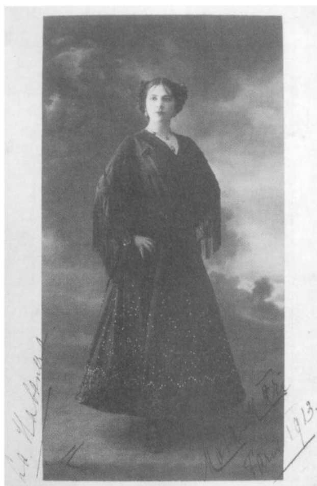
Margaretha Zelle as 'La Habanera', Paris, 1913. Mata Hari Collection, Fries Museum, Leeuwarden.