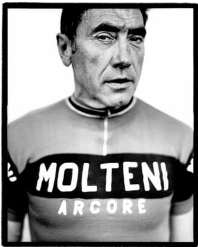
Eddy Merckx.

And promptly finished in second place. When two weeks later he did even better and actually won the Bordeaux-Paris race, there was no stopping him.