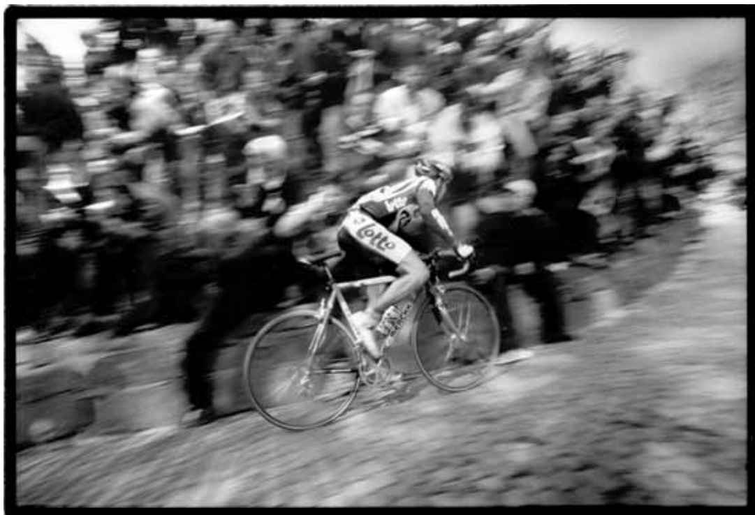
Peter Van Petegem (Kapelmuur, Geraardsbergen).

champion three times, won the Tour de France five times, the Tour of Italy five times and the Tour of Spain once, as well as a record number of classics: Milan-San Remo (7x), Liège-Bastogne-Liège (5x), Paris-Roubaix (3x), Ghent-Wevelgem (3x), La Flèche Wallonne (3x), the Tour of Flanders (2x), the Tour of Lombardy (2x) and the Amstel Gold Race (2x). In 1972 in Mexico he set a new world record for the hour with 49.431 km. Merckx's achievements held the whole nation entranced.