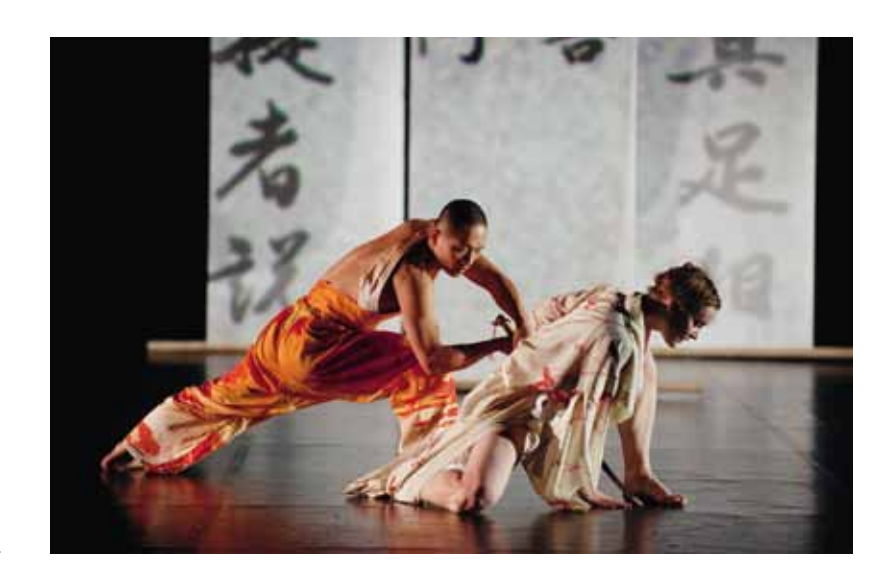
TeZukA, 2011.