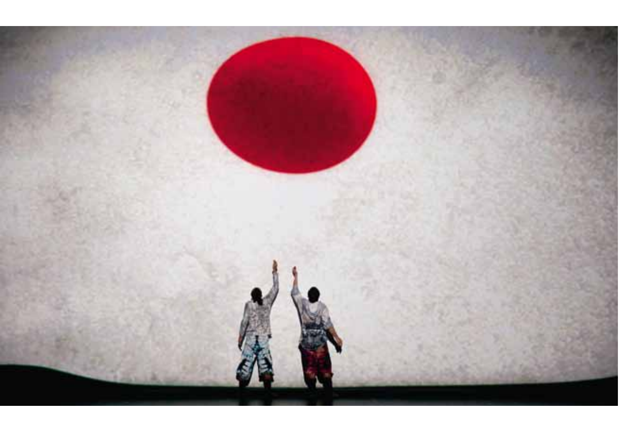
TeZukA, 2011.

under this label, Babel<sup>WORDS</sup> , hits the bull's-eye right away. The performance is a baroque extension of Cherkaoui's mission. The problem of Biblical language-confusion is transposed to the question of how in spite of everything we can strive towards understanding and harmony. Where is the universal beyond the differences? To reinforce their question Larbi and fellow-choreographer Damien Jalet seek out eighteen performers (dancers and musicians) from no less than thirteen different countries. Between them they speak fifteen languages and profess seven different religions. Moreover, most of the twelve dancers come from a bicultural family background, just like Cherkaoui and Jalet themselves.