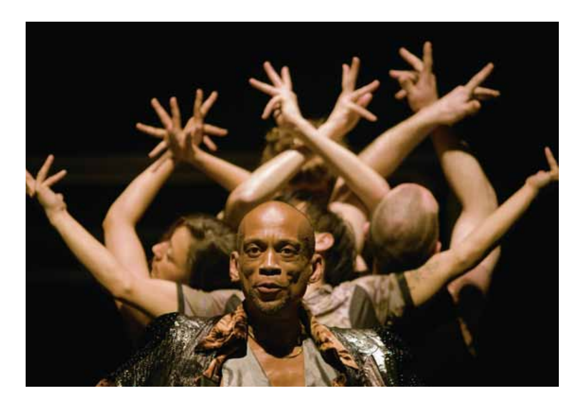
Babel<sup>WORDS</sup>, 2010.