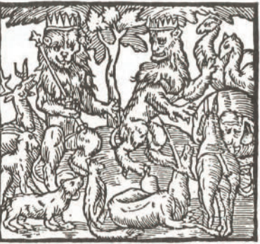
Cot Delff/op Bupn Barmanl Schinchele woonen aent Merct-belt. Aimo 1589.