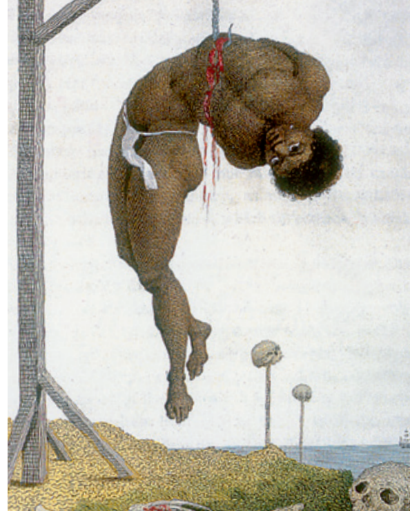
Cruelty towards slaves in Surinam.

seldom had more than ten slaves, the huge demand for colonial products on the European market made Surinam interesting to investors; and they wanted to make as much profit as they could in as short a time as possible. So Surinam was flooded with new slaves from Africa, so-called 'salt water slaves', who could be put to work on plantations where the real owner was rarely, if ever, present. Before this plantation owners had still been inclined to take a paternalistic attitude to their slaves. Now things changed drastically; the degree of abuse and exploitation was such that Surinam acquired the dubious reputation of being the most abominable place on earth and slaves from Curaçao, for instance, quaked with fear at the thought of being sent to Surinam as a punishment.