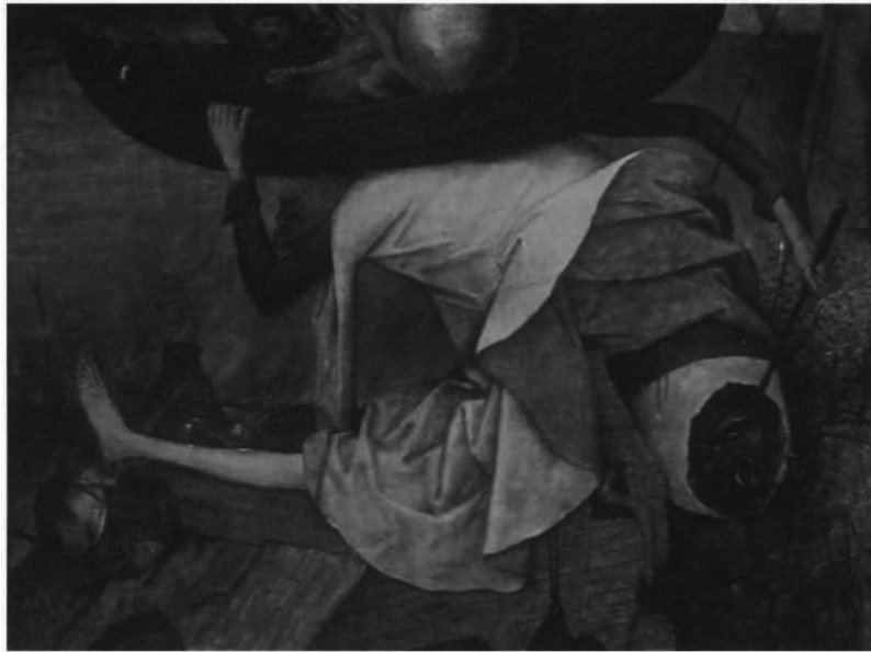
The Dukatenscheisser (detail from Dulle Griet ).