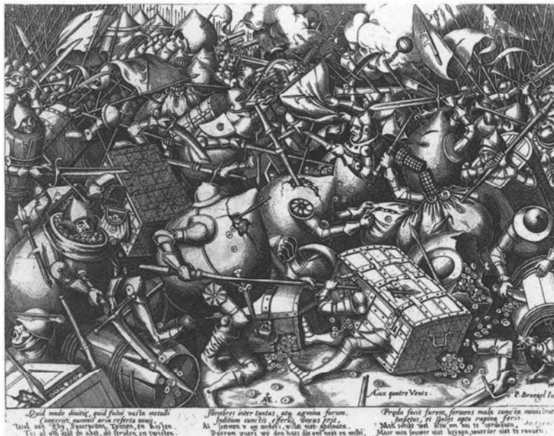
Pieter van der Heyden (after Pieter Bruegel the Elder), The Battle Between the Money-Banks and Strong-Boxes . c.1558. Koninklijke Bibliotheek Albert I, Prentenkabinet, Brussels.

The forms of these fantasies are rooted in early modern psychology. Country people had customarily combined supernatural causes with everyday images to describe their unconscious lives, although they did not, naturally, think of it in these terms. They regarded dreams as a gate to the spirit world, the territory of ghosts, sleepers and the devil. The Dukatenscheisser 's coins – and Griet's treasure – appear also in this world. Freud commented that, 'in dreams in folklore, gold is seen in the most unambiguous way to be a symbol of faeces. If the sleeper feels the need to defecate, he dreams of gold, of treasure.' 9 In dream-tales from many different regions, the connection between treasure and excrement is recognised in a comic punchline, when the dreamer wakes up. A fifteenth-century story is typical: 'My neighbour once dreamt that the devil had led him to a field to dig for gold, but he found none. The devil said, "It is there for sure, only you