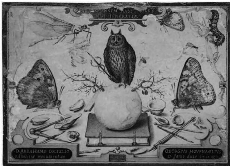
Joris Hoefnagel, Emblematic Composition in honour of Abraham Ortelius . 1593.

As in the broadsheets and farces, the Griet's dominant images come from the fracturing world of folk culture. Echoes of sinister tales can be heard in the earliest description (1600) of the painting: ' A Dulle Griet, who robs in front of hell, wears a vacant stare and is (cruel, or) strangely and weirdly dressed. ' The proverb, ' to rob in front of hell ', referred to women who feared neither death nor the devil, and ' Dulle Griet ' was by extension a folk synonym for ' virago ' or ' bitch .' The fluid image of Griet could be woven