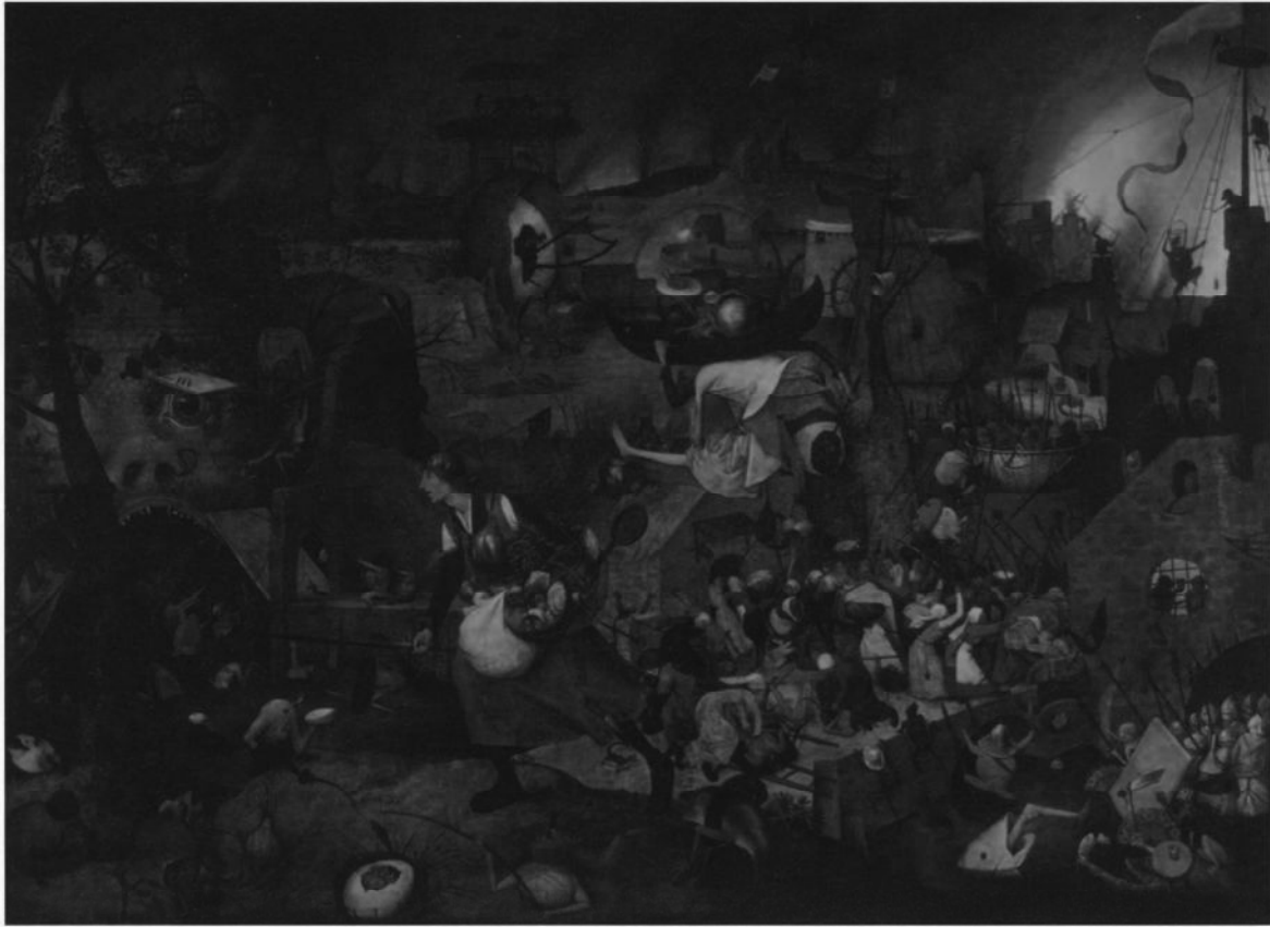
Pieter Bruegel the Elder, Dulle Griet . c.1562. Museum Mayer van den Bergh, Antwerp.

nations.’ 2 The Antwerp stock exchange, the Bourse, controlled the wealth of Europe, and in mid-century it was at the height of a boom. This boom was founded on new forms of credit, necessary to finance the high risks of sea-trading. The shift to credit allowed merchants to defer and interweave the consequences of their ventures, and citizens became used to the psychology of gambling on future profits. Like modern trading-floors, the Bourse was no sober club. Incidents of violence were not unknown and the building itself (new in 1531) was plagued by vandalism and graffiti. It was a centre for gossip and scandal of all kinds. ‘ He that will believe every nue that is blasted in Flanders among merchants shall have a mad head, ’ commented the English spy Stephen Vaughan to Thomas Cromwell in a dispatch of 1535.