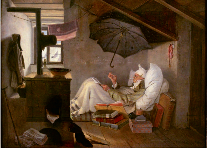
Der Arme Poet ( The Poor Poet ) by Carl Spitzweg, 1839. Collection Neue Pinakothek, München