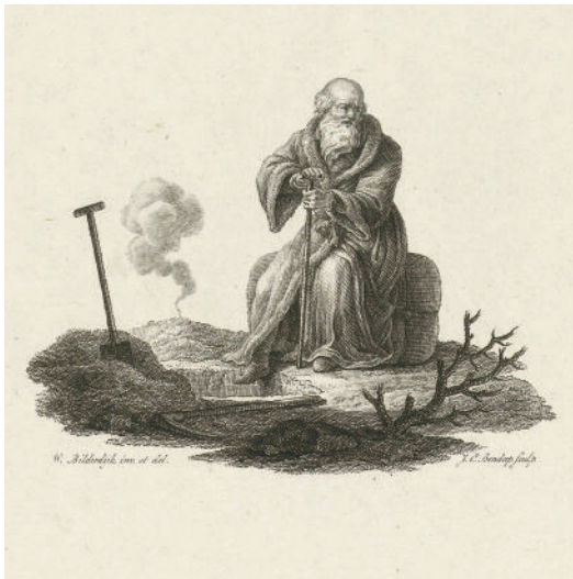
Title vignette of De voet in 't graf (One Foot in the Grave) by Willem Bilderdijk, Rotterdam, 1827. Collection Bilderdijk Museum Amsterdam

According to Aristotle melancholy was connected to a surplus of black bile. A genius ran the risk of being plunged into melancholy, but that disposition was also a condition for achieving greatness. After 1750 melancholy became a fashionable ailment.