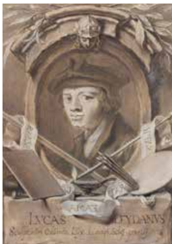
Peter Paul Rubens after Andries Stock after Lucas van Leyden, Self-portrait , c. 1633, brush and ink, white and yellow body colour over a sketch in black chalk, 27.9 x 20 cm, Fondation Custodia, Collection Frits Lugt, Paris