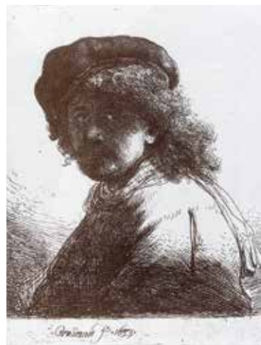
Rembrandt, Self-portrait , 1633, etching, 13.2 x 10.3 cm, Rijksmuseum, Amsterdam