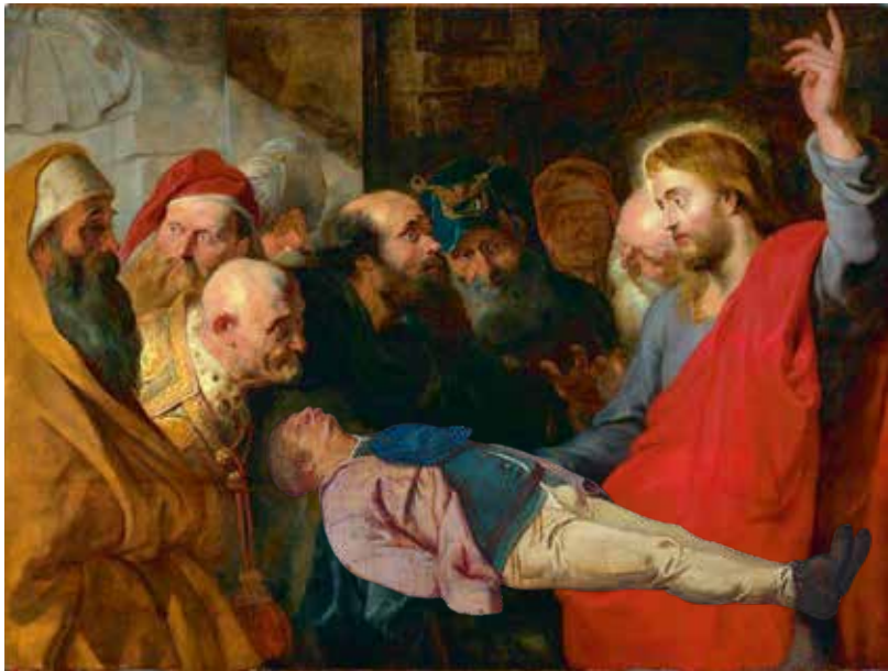
Montage of detail from Adriaen Brouwer, Drunken Peasant Passed out in a Tavern , c. 1630, Museum Boijmans Van Beuningen, Rotterdam onto Peter Paul Rubens, The Tribute Money , c. 1612, Legion of Honor Museum, San Francisco (also copied in an engraving by Claes Jansz Visscher)