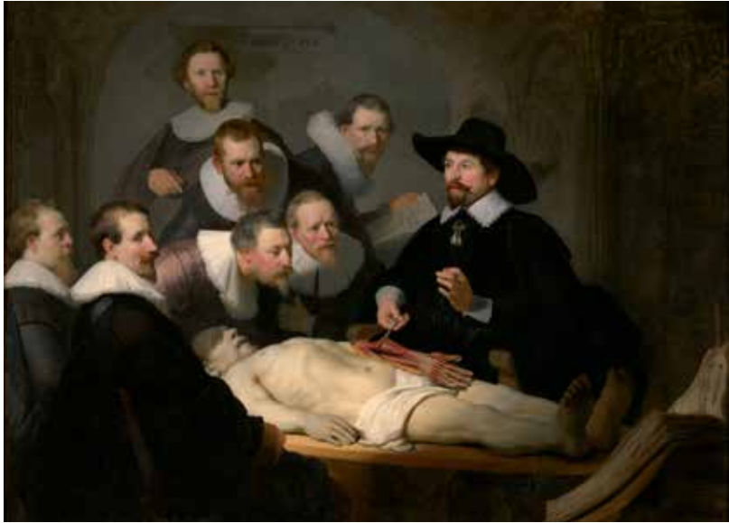
Rembrandt, The Anatomy Lesson of Dr. Nicolaes Tulp , 1632, oil on canvas, 169.5 x 216.5 cm, Mauritshuis website, The Hague

chase of an early Rubens painting, Hero and Leander . He also owned seven paintings by another Antwerp artist whom Rubens admired and envied for his truth to (low) life, Adriaen Brouwer. My favourite example of Rembrandt's appropriation of motifs from Flemish painting concerns his first Amsterdam masterpiece, the Anatomy Lesson of Dr. Nicolaes Tulp , painted in early 1632.