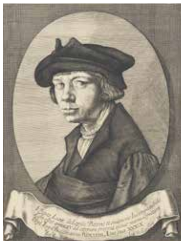
Andries Jacobsz Stock after Lucas van Leyden, Self-portrait , c. 1620, engraving, 21.8 x 16.7 cm, Rijksmuseum, Amsterdam

to the artist, calling Lucas the light, moon and sun of the paintbrush. Rubens, Rembrandt and Lucas van Leyden were participants in a Low Countries artistic culture that covered all seventeen provinces of north and south.