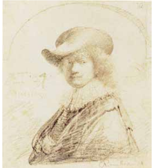
Rembrandt, Self-portrait, 1631 etching, touched up in black chalk, 14.8 x 13 cm, British Museum, London

up unannounced at the court of the stadholder, Frederik Hendrik. Despite his proud ownership of six paintings by the famous master and his desire for more, the stadholder had no choice but to send him packing. Two days after his arrival, Rubens left the Republic with his tail between his legs, going back to face the extreme annoyance of Flemish aristocrats at home, who saw their own diplomacy being undermined by the Infanta and her favourite.